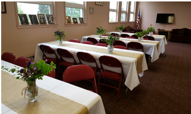
Center Social Room Rent $150.00