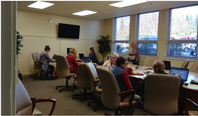
Center Conference Room $100.00

The Center has spacious rooms for meetings, conferences, holiday parties, and family events. Our rentals are able to meet any budget. Catering is also available by our Executive Chef.