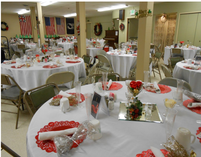
Center Dining Room Rent $300.00